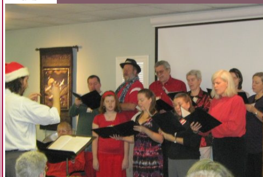
The Choir sings at the Holiday Music Service

Deadline for next month's beacon is Tuesday, January 25 at 8:00 pm